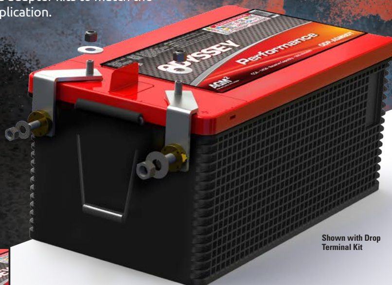
Shown with Drop Terminal Kit

*Vehicle attachment hardware not included